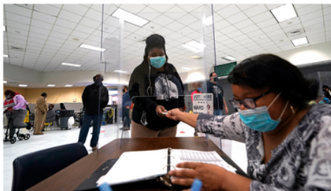
A woman verifies her identification to vote through a computer screen at a voting station.